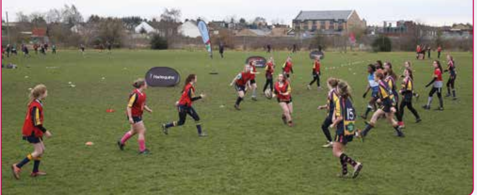
Girls pre-match community club tournament

To read more about the programme visit: www.harlequins.foundation/participation/