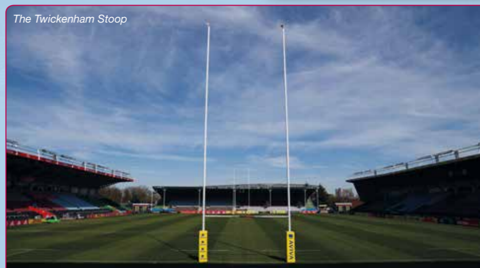
The Twickenham Stoop

We look forward to working closely with you all to realise that ambition and would like to know how you would like to participate in this process. To let us know your thoughts and to be kept up-to-date, please contact vision@quins.co.uk or visit www.QuinsVision.co.uk .