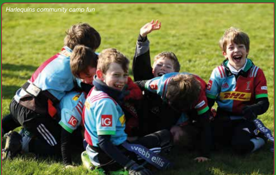
Harlequins community camp fun