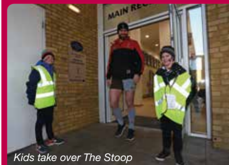
Kids take over The Stoop