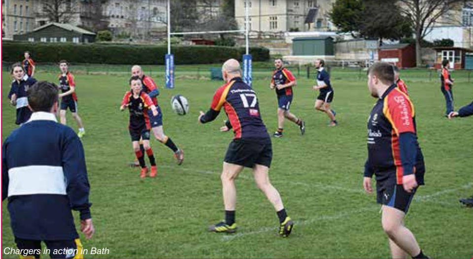
Chargers in action in Bath

The Harlequins Foundation is bringing rugby to new audiences across South London and rural Surrey by hosting the inaugural Special Educational Needs (SEN) Rugby Festival at The Stoop on 18th May.